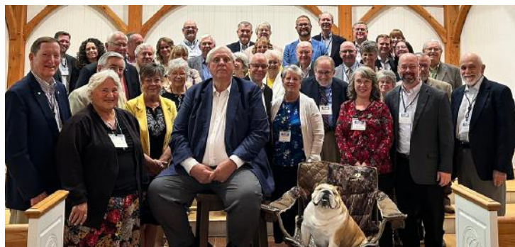
FOM leaders and their wives with West Virginia Governor Jim Justice and Baby Dog