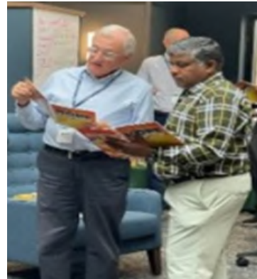
Good Soil Training at BJU